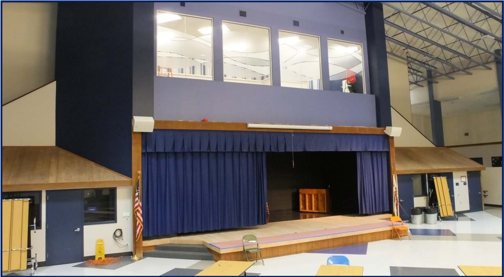
Cherrywood FIS – From MPR