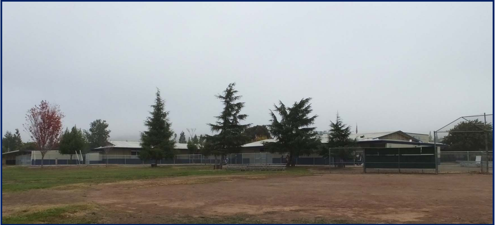
Piedmont Middle School – Fencing