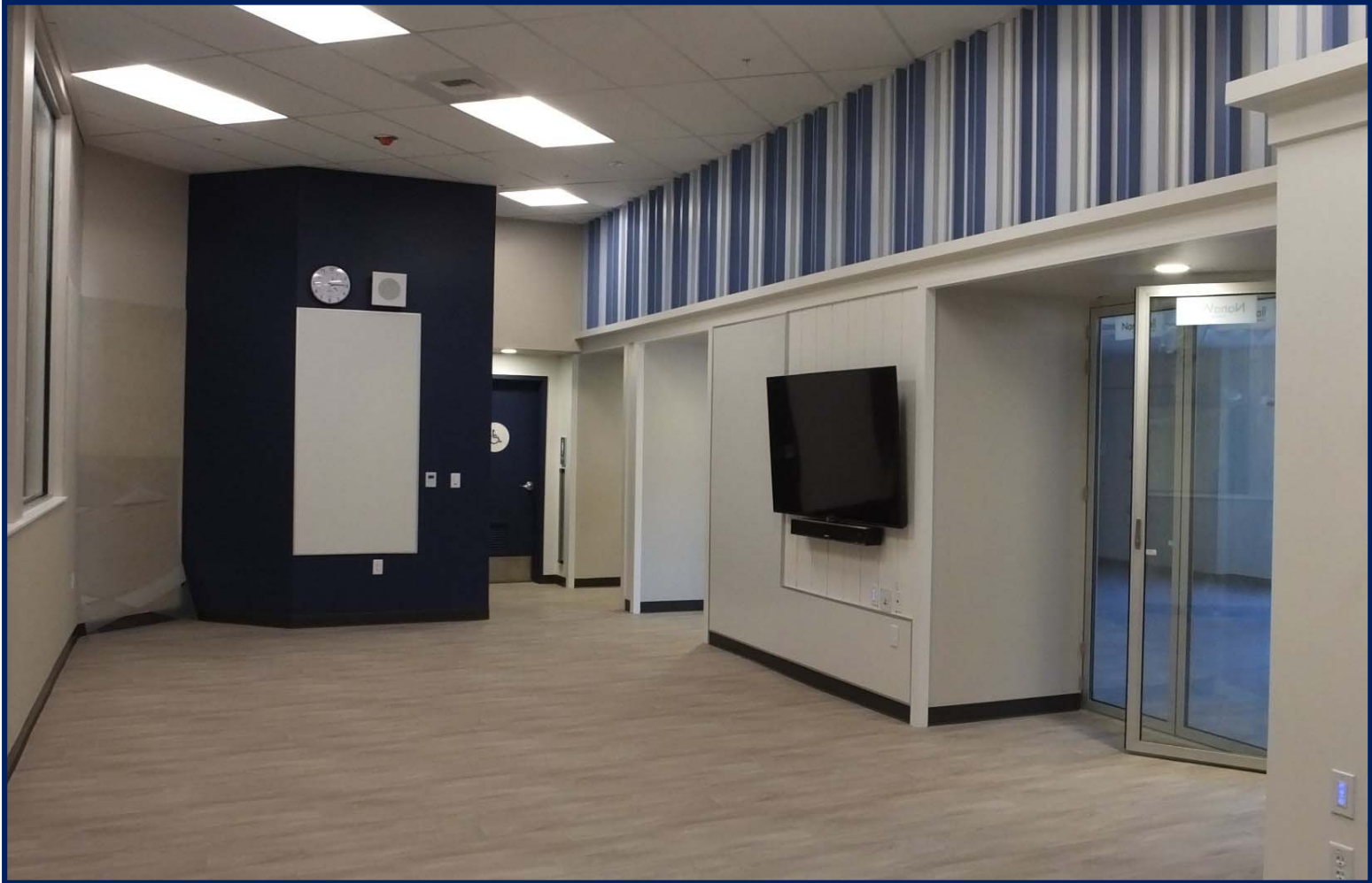
Cherrywood FIS – Front Space Looking West