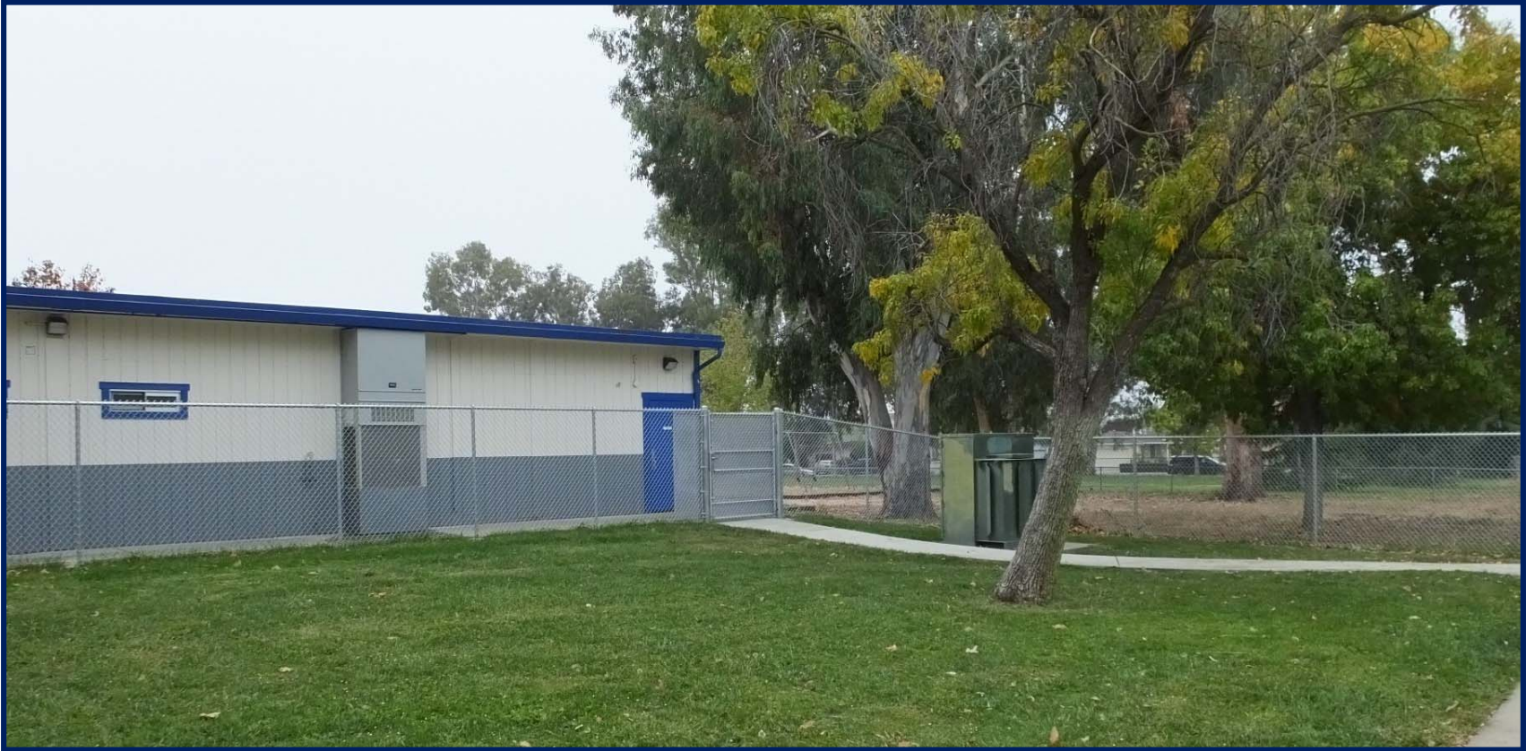
Toyon Elementary School – Fencing