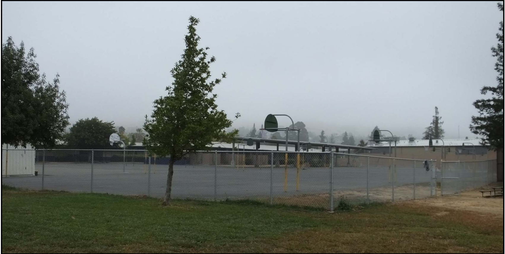
Piedmont Middle School – Fencing