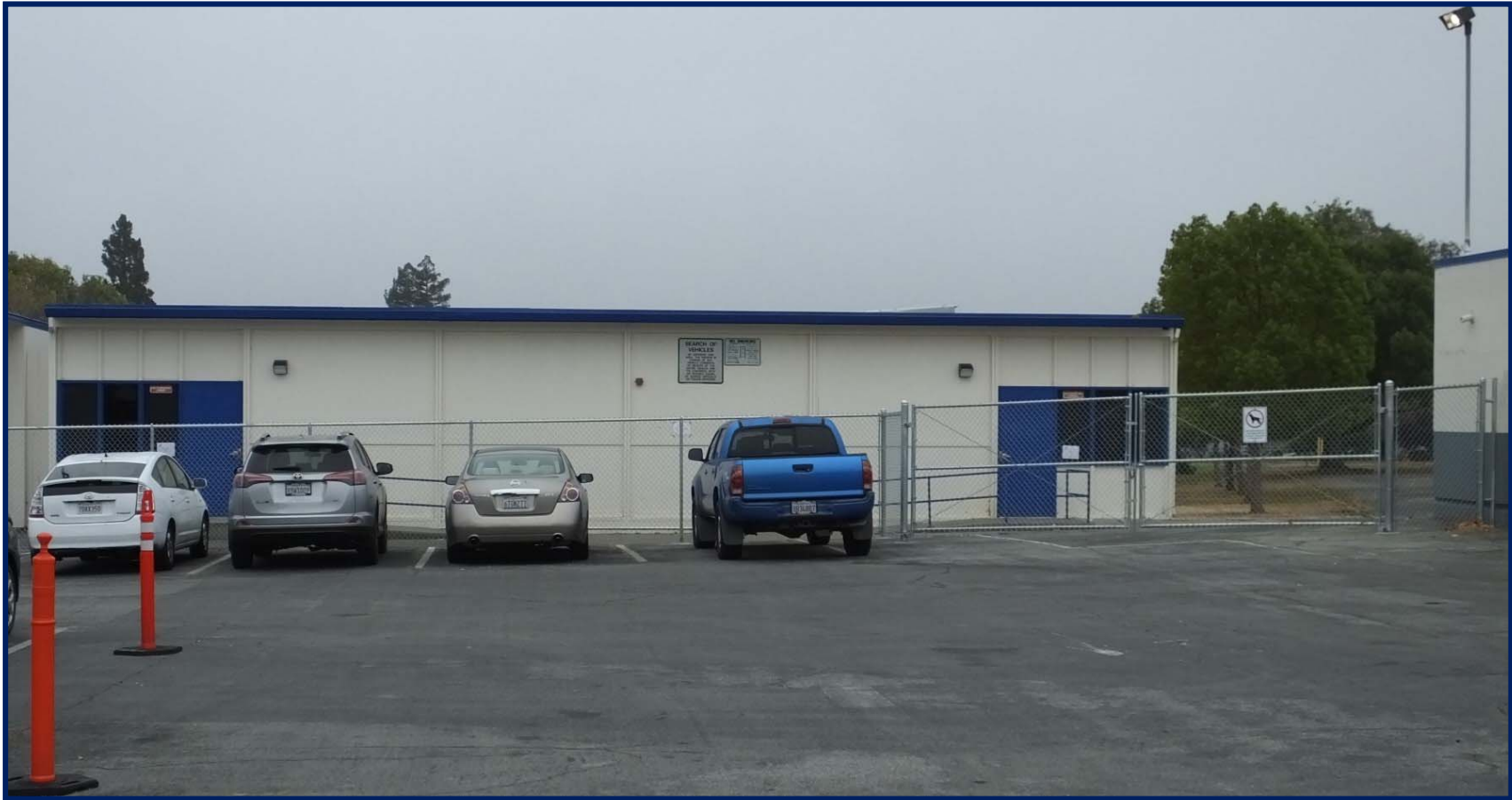
Toyon Elementary School – Fencing